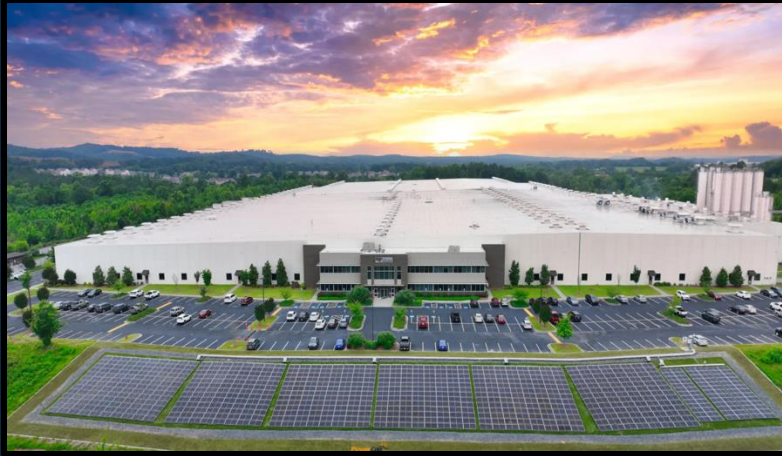
SHAW PLANT T1