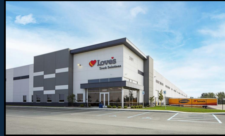
LOVES TRUCKS DISTR. CENTER