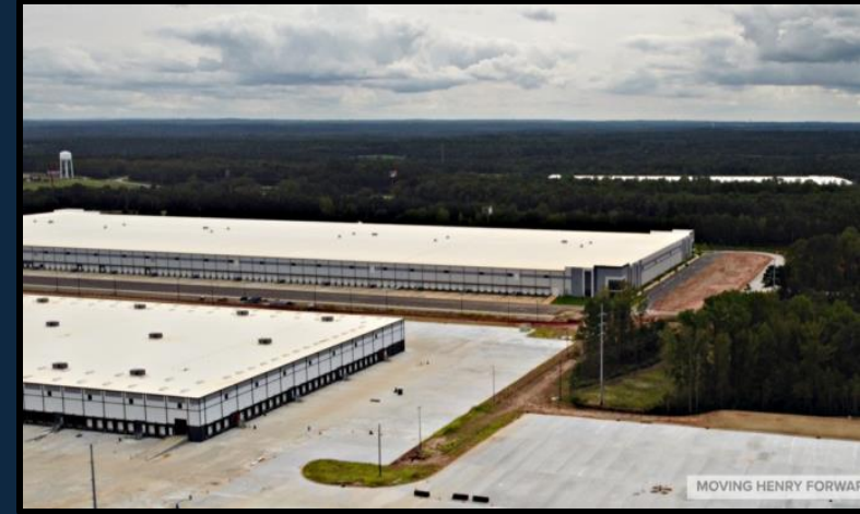
HOME DEPOT DIST. CENTER