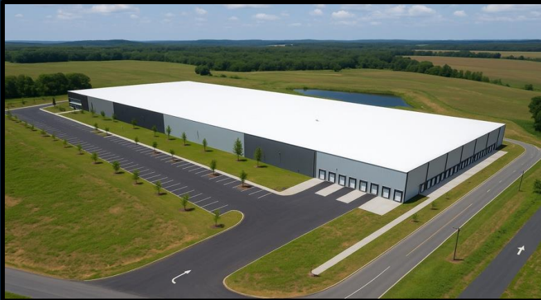
MILLER FERRY WAREHOUSE