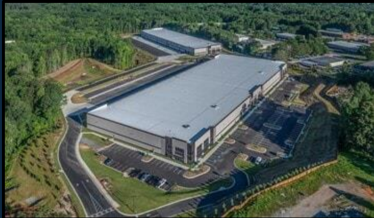
NORTH ATLANTA COMMERCE CENTER