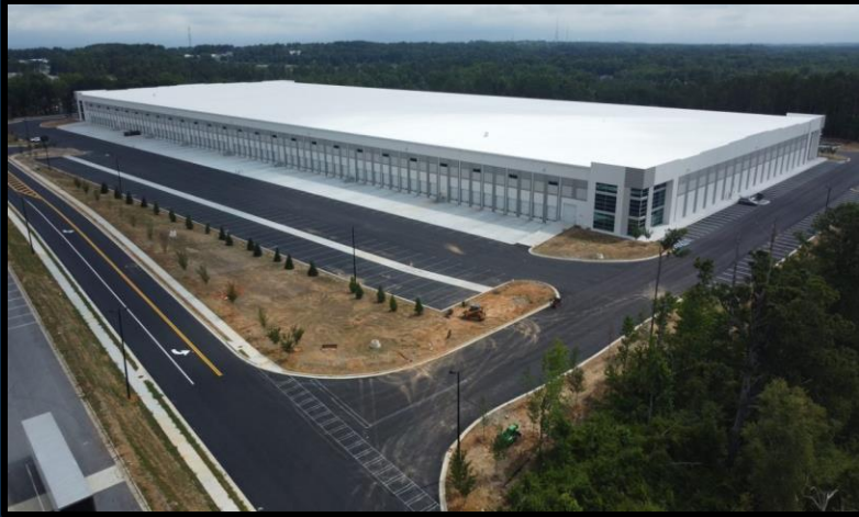
BRIGHTSTAR INDUSTRIAL PARK